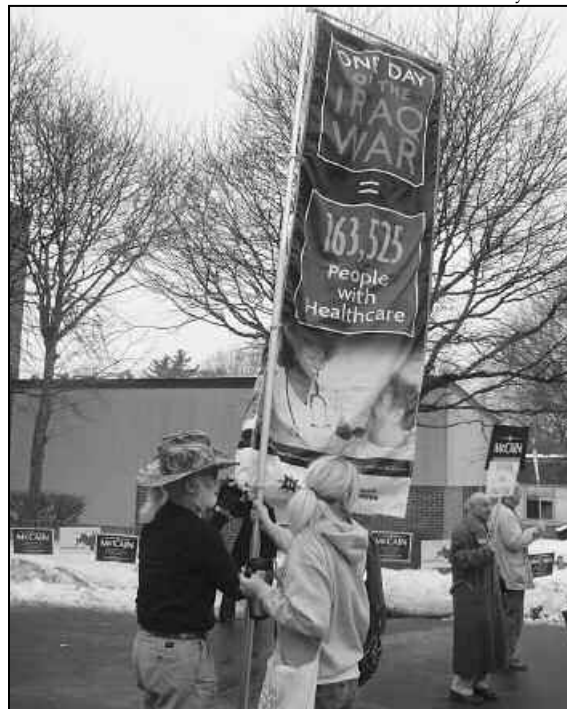
AFSC Cost of War Banner at New Hampshire Primary

about the cost of war and ask them how they would rather see the money spent. There will also be art supplies for those that prefer to write or draw their answers. All of these things will get posted on a website the group is creating as well as shared with the Rhode Island Congressional delegation as other volunteers meet with them. The Cost of War brochures will be handed out, other AFSC literature will be available and, hopefully, a bit more of the bridge between communities in Providence will be built.