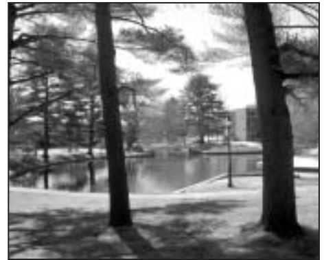
Wheaton College Pond

NEYM MINISTRY & COUNSEL'S NEW DISABILITIES AND ACCESSIBILITY Subcommittee is looking for ways to make Yearly Meeting Sessions more open to people with a variety of special needs. In addition to accessibility issues such as mobility, chemical sensitivities, hearing and vision impairments, the Subcommittee is beginning to address the concerns of families with children and teens with disabilities. When registering for Sessions, parents of these families can indicate particulars of their situation in the "Accessibility Needs" section of the registration form. A Subcommittee member will call the family to discuss ways to make Sessions work better for them.