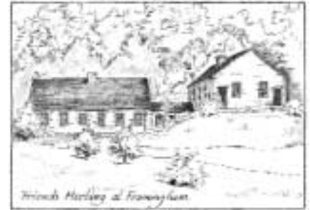
Framingham (MA) Meetinghouse