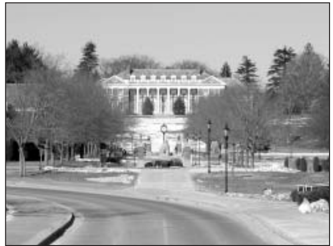
Stonehill College—Easton, Massachusetts

NEYM Ministry & Counsel's Disabilities and Accessibility Subcommittee is looking for ways to make Yearly Meeting Sessions more open to people with a variety of special needs. In addition to accessibility issues such as mobility, chemical sensitivities, hearing and vision impairments, the Subcommittee is beginning to address the concerns of families with children and teens with disabilities. When registering for Sessions, parents of these families can indicate particulars of their