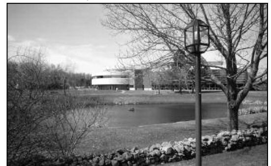
Bello Center and Library at Bryant University

I want to take this opportunity to thank NEYM individuals and meetings who continue to support the EQ Fund each year. For questions about the Fund, please call me at 207/827-4493