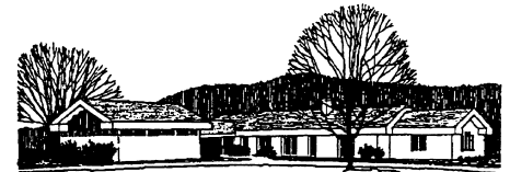
Mt. Toby Meetinghouse, Leverett, MA

• Mt. Toby (MA) MM hosted a session on Quaker’s and GI’s so that Friends can become more familiar with what it means to be in the military. Three members of the meeting community spoke of their experiences as GI’s and Friends who work with the American Friends Service Committee’s GI Rights Hotline told stories about some of the GI’s who have called them.