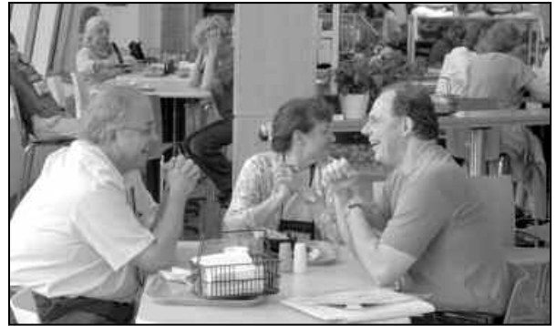
A Friendly meal at the 2006 NEYM Annual Sessions

We want to ensure that the Equalization Fund is available in the future for those who can not attend NEYM without help. The future of the NEYM Equalization Committee will be decided at NEYM in August. Thank you for helping with the Equalization Fund, and please hold us in the light.