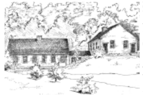
Framingham (MA) Meetinghouse

• Framingham (MA) MM's First Day School Committee sponsored a meeting wide conversation and reflection on NEYM's eighth Query on the Care of Children within the Meeting. Queries have been the First Day School's theme this year.