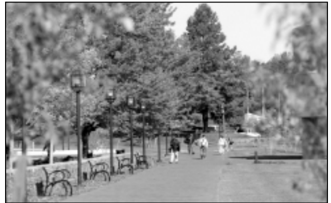
Bryant College—Smithfield, Rhode Island

We understand that Friends cannot support a completely safe environment, howev-