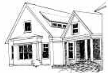
Wellesley (MA) Meetinghouse

is at risk for emotional, physical or sexual abuse and where no adult is at risk for false accusation. We understand that these are troubling issues to contemplate. We seek also a community where difficult issues can be discussed and where our loving concern for one another is strengthened, not diminished by these discussions." The minute then lists several practices implemented by the meeting to ensure safety. It concludes by acknowledging, "We affirm this minute as a step in this process, expecting further steps as way opens."