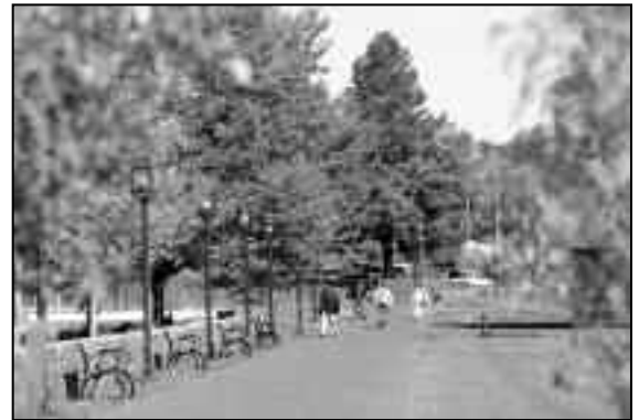
Bryant University campus

accessible to all of us. Without it, we'd be failing on the equality and community testimonies and could not conduct our business sessions in good order.